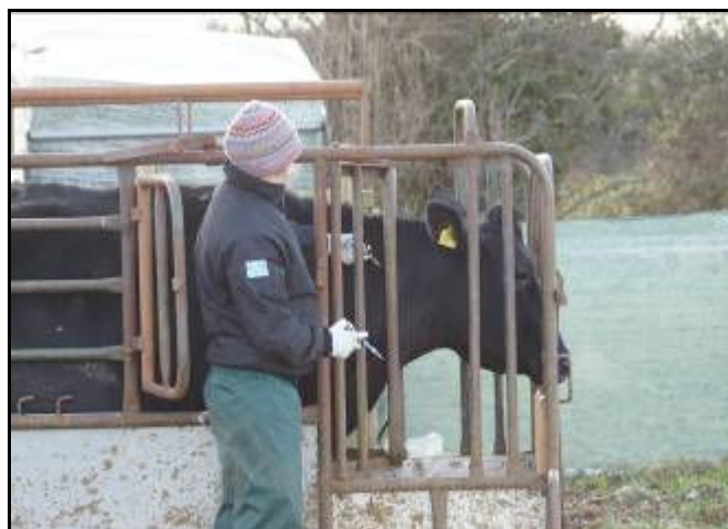
Fig 3: TB testing - Vet injecting avian tuberculin.

They then forward the information on to the local Animal Health Office who will then locate the origin of the samples and decide what further action needs to be taken.